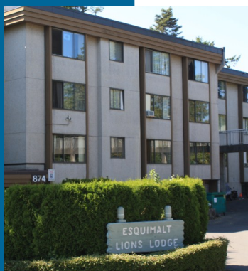
Esquimalt Lions Lodge to Receive Upgrades

Esquimalt Lions Lodge, our 77 unit seniors building in the Tillicum/ Craigflower area of Esquimalt, is getting a facelift. Greater Victoria Housing Society is redecorating and upgrading the entrance, front lobby and resident’s lounge to modernize these spaces and make them more attractive and modern. We used the design services of Astrid Firley-Eaton who came up with a bold and colourful scheme that complements the building. New lighting, paint colours, and a full redecoration of the lounge, including carpet, window coverings and furniture is underway.